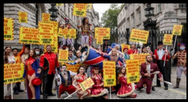
Sir Ian McKellen Circus Protest

and received page 3 coverage in the <u>Times</u> and <u>Guardian</u>, and inspired impassioned op-eds in the <u>Telegraph</u> and